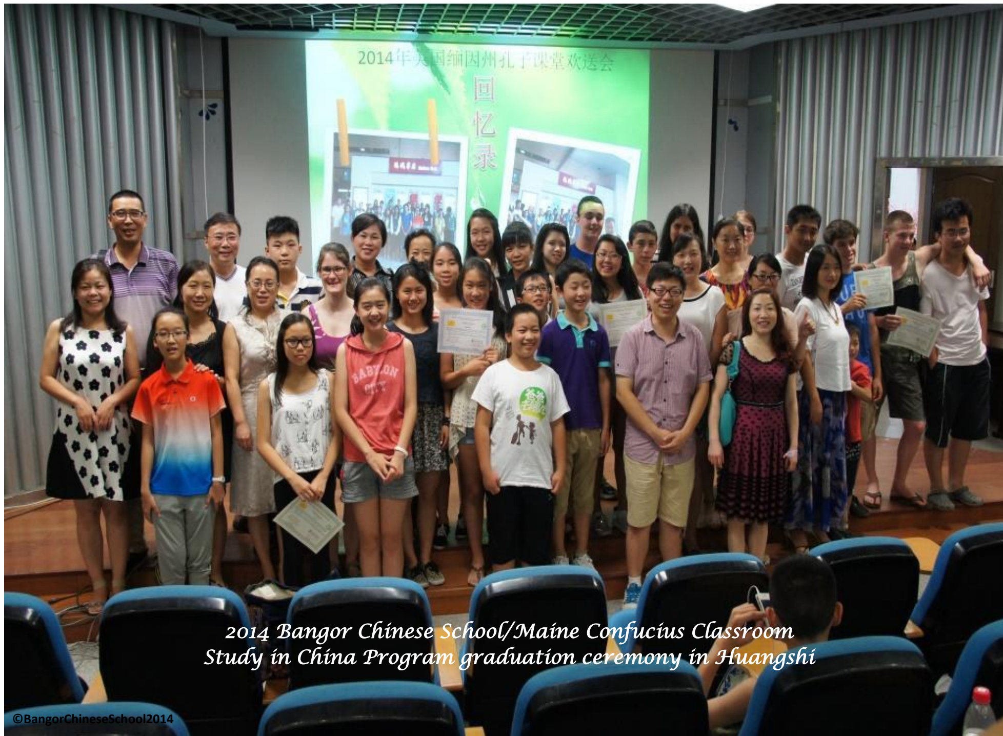
2014 Bangor Chinese School/Maine Confucius Classroom Study in China Program graduation ceremony in Huangshí